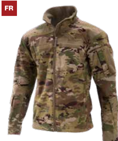
ELEMENTS™ JACKET IWOL WITH BATTLESHIELD X® FABRIC