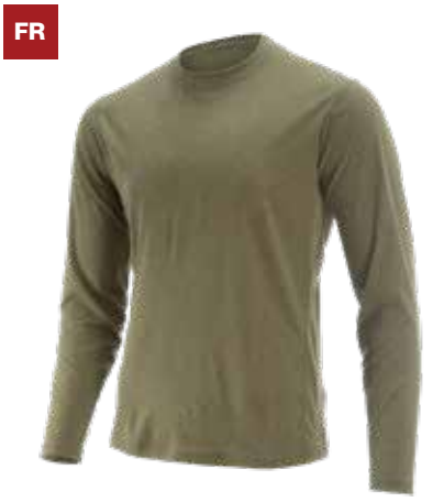
INVERSION CREW LIGHTWEIGHT