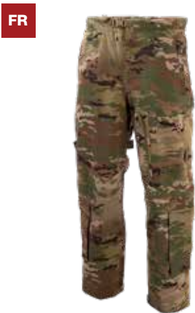
ELEMENTS™ PANT CWAS WITH BATTLESHIELD X® FABRIC