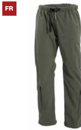
ELEMENTS™ PANT NAVAIR WITH BATTLESHIELD X® FABRIC

Colors: SAGE GREEN, COYOTE TAN #MPNT00001