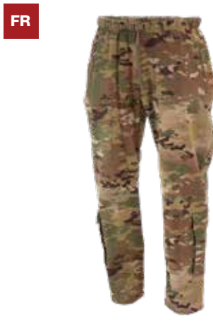
ELEMENTS™ PANT IWOL WITH BATTLESHIELD X® FABRIC