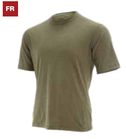
INVERSION T-SHIRT LIGHTWEIGHT

A well-dialed kit can be worthless with a poorly developed base layer that holds onto moisture or creates stress on the skin. With this in mind, we built the Inversion Lightweight and Midweight Base Layers with superior moisture management and next to skin comfort. Our proprietary synthetic fabric excels at stretch and recovery, which an active soldier expects and needs from a base layer, wash after wash.