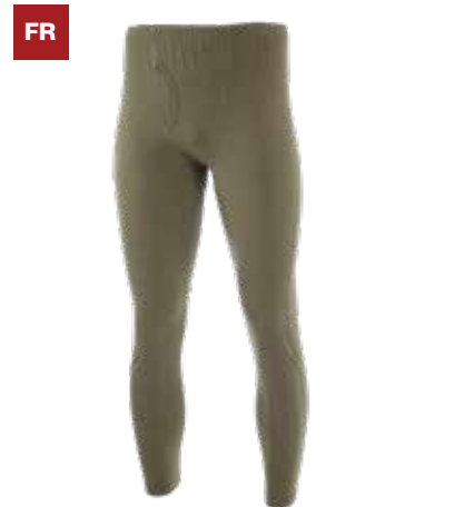
INVERSION BOTTOM LIGHTWEIGHT