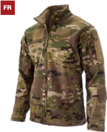
ELEMENTS™ JACKET CWAS WITH BATTLESHIELD X® FABRIC

Our Elements™ softshell lineup offers world-class performance using Massif® Battleshield X® FR fabric, a flame resistant nylon-faced laminate featuring Gore® FR stretch technology. The system offers exceptional breathability, durability, and fantastic warmth-to-weight ratio prioritizing fit and functionality for a garment that performs when you do.