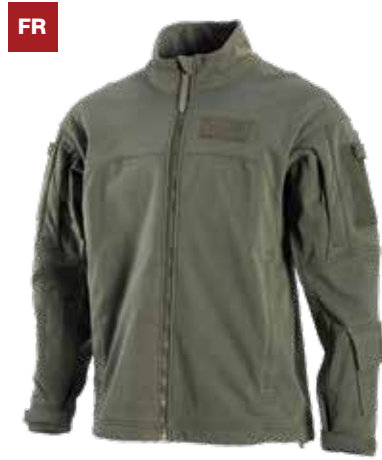
ELEMENTS™ JACKET NAVAIR WITH BATTLESHIELD X® FABRIC

Colors: SAGE GREEN, COYOTE TAN #MJKT00005